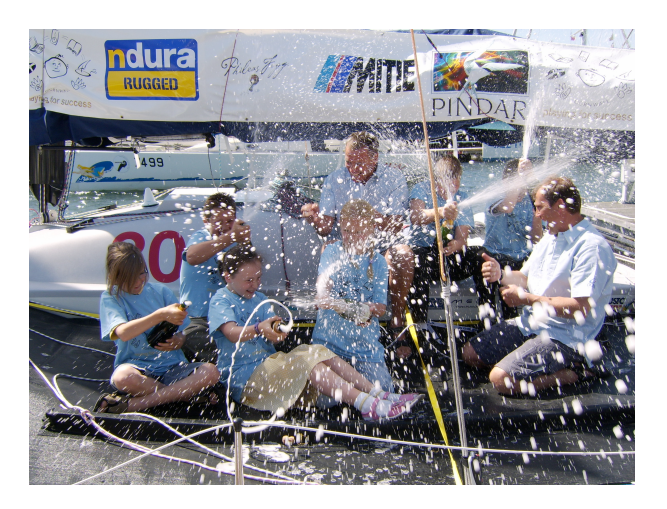
Celebrating the naming of the 'Cornwall Playing for Success.'