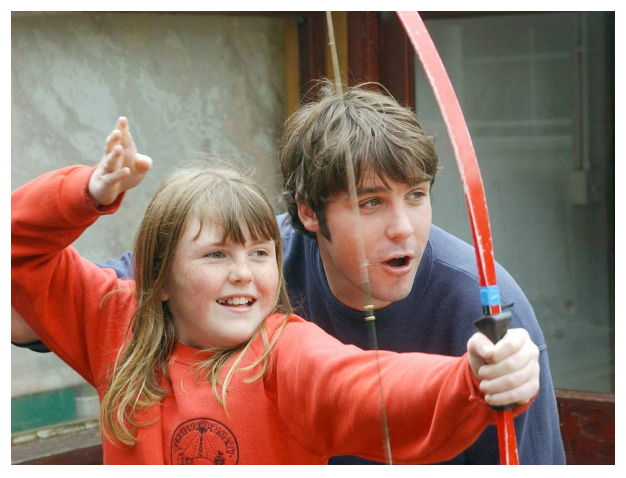
Archery at the Delaware Adventure Zone