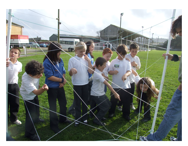
Team Work at the Pirates Learning Zone