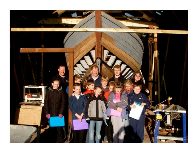
DAZL pupils at the Spirit of Mystery